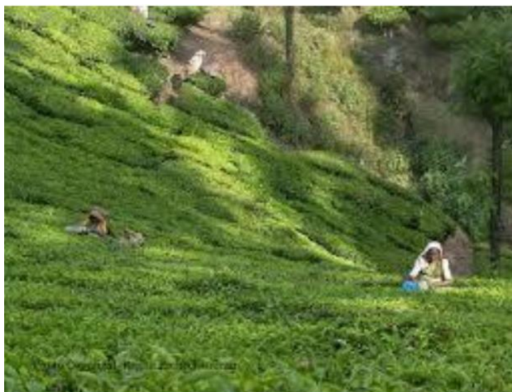
Tea plantation requires abundant labour for picking leaves.