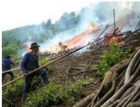
In shifting agriculture, a patch of forested land is cleared by the farmers for the purpose of cultivation.