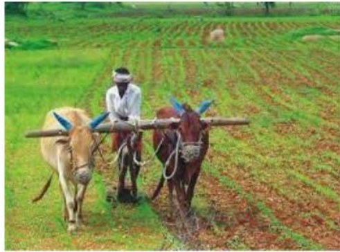
In subsistence farming, methods of farming are traditional and primitive.