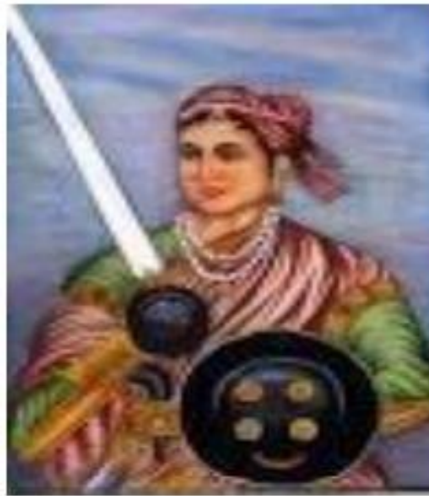
Rani Laxmibai was one of the leading figures of the Indian rebellion which broke out in 1857.